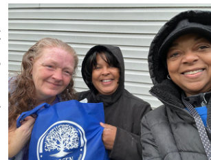
CHOSEN CDC representatives meeting a parent to share the joy of the season.