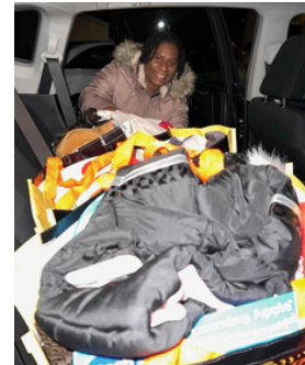
Happy parents receive Christmas gifts for the family from Zeta Phi Beta Sorority, Inc.