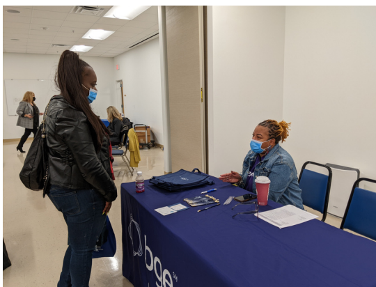
BGE Recruiter meets with a job fair attendee