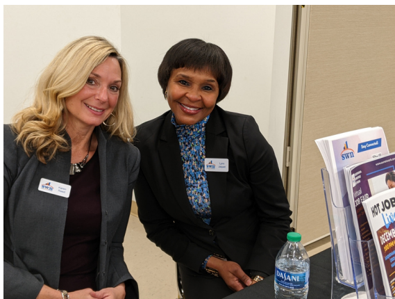
Above: Representatives of the Susquehanna Workforce Network. Left: YRN Designs at work taking headshots.

Mt. Zion Baptist Church of Aberdeen opened its doors on November 29, for a community job fair sponsored by CHOSEN CDC and Freedom Federal Credit Union. Other business and agencies that joined in the fair included Susquehanna Workforce Network, the Boys & Girls Clubs of Harford and Cecil Counties, Harford County Public Schools, State of Maryland Department of Veterans Affairs, BGE, and the City of Baltimore. Job seekers were given the opportunity to meet with recruiters to discuss real job opportunities, along with participating in a resume review and to take a professional headshot courtesy of YRN Designs.