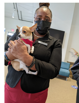
CHOSEN CDC Greeter welcomed all guests who came out to the job fair.