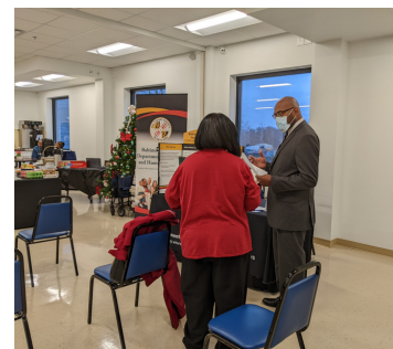
Recruiters had the opportunity to greet attendees.

Mt. Zion Baptist Church of Aberdeen opened its doors on November 29, for a community job fair sponsored by CHOSEN CDC and Freedom Federal Credit Union. Other business and agencies that joined in the fair included Susquehanna Workforce Network, the Boys & Girls Clubs of Harford and Cecil Counties, Harford County Public Schools, State of Maryland Department of Veterans Affairs, BGE, and the City of Baltimore. Job seekers were given the opportunity to meet with recruiters to discuss real job opportunities, along with participating in a resume review and to take a professional headshot courtesy of YRN Designs.